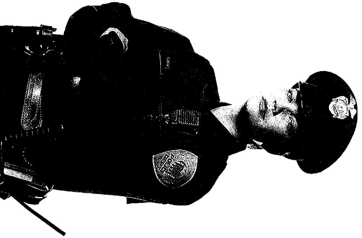
I am a police officer.